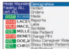
Patient Data Management